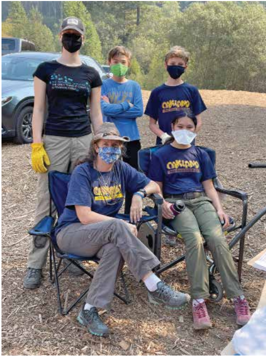
Scouts from Troop 202 and family members take a break from their work along the Willow and Gwin Canyon trails.