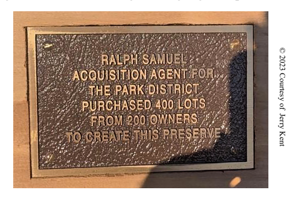
A bench honoring Ralph Samuel was erected in 2002 at the top of the Stonewall-Panoramic Trail. The bench plaque pictured here replaces the original which unfortunately was stolen in 2020.

time acquired in excess of 1,000 acres of parkland for approximately $4 million, plus several miles of regional trails connecting existing regional parks.