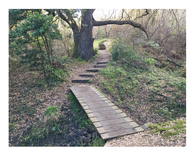
The loss of the heritage oak has transformed the Willow Trail's microclimate from a cozy, shaded area (above, January 2022) into an open and sunny path (page 3, top left, April 2023).