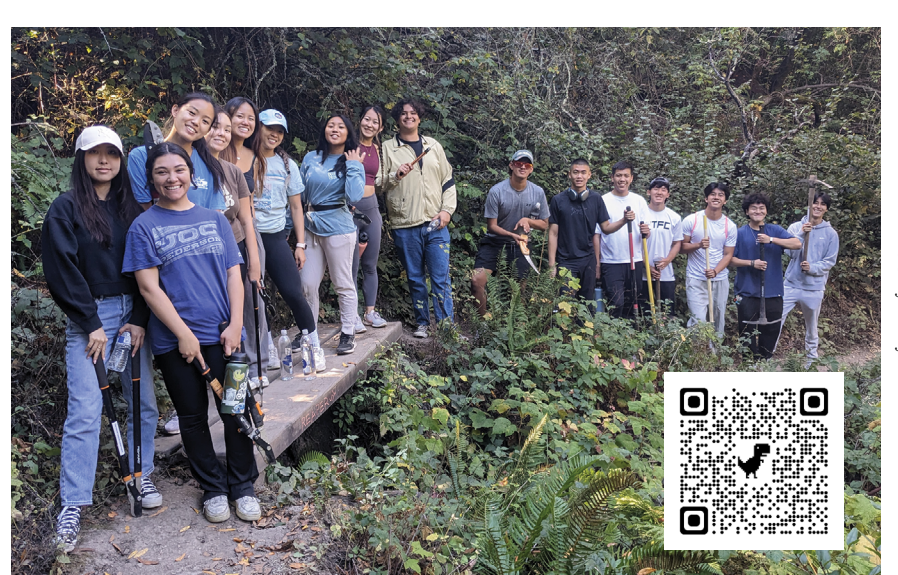
Scan the QR code above or explore the trails tab on our website to learn more about the network of trails in Claremont Canyon.

Many moments and memories are created on these trails. The flora and fauna of the area are rich and diverse, with fun opportunities for sightings of local wildlife such as gray foxes or the shy Pacific ring-necked snake. Whether enjoying these trails by volunteering or simply setting out for a hike, we can all take a moment to appreciate our canyon and the wonderful trails that give us access.